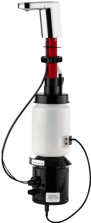
Product protected under: Pat. www.bobrick.com/patents/